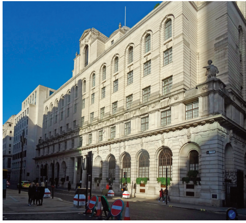
Top: Looking from Gracechurch Street into Lombard Street, the former site of London Chief Office.

Above: The former Midland Bank Head Office, Poultry.